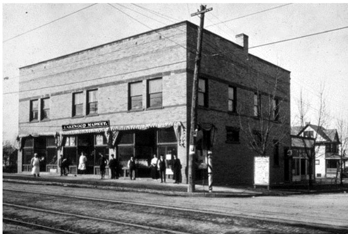
Lakewood Market