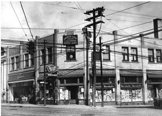
14800-06 Detroit Avenue 1944 housing Marshall Drug and Carson's Department Store with American Legion Post 66 on the second floor.