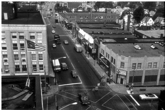
14800-06 Detroit Avenue 1985.