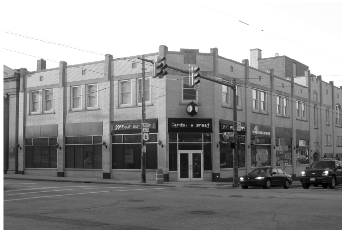
14800-06 Detroit Avenue 2012. The same basic building after numerous modifications still stands there today.